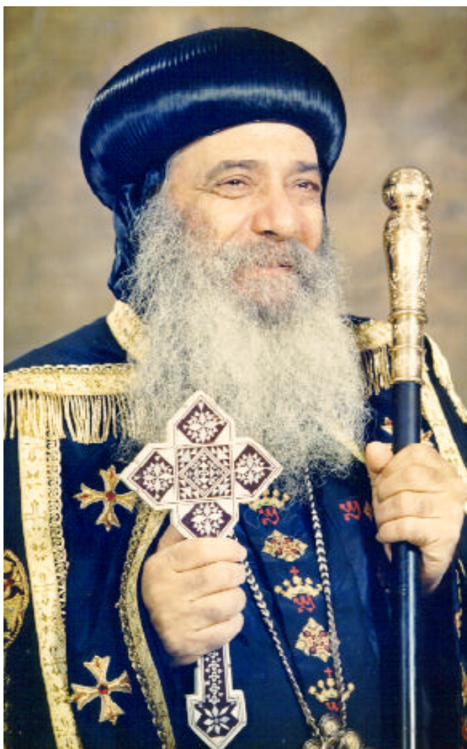
H.H. Pope Shenouda III, 117th Pope of Alexandria and the See of St. Mark